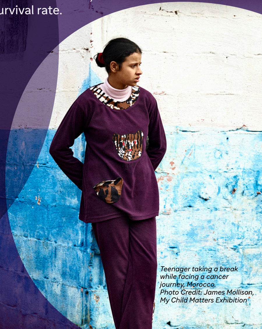
Teenager taking a break while facing a cancer journey, Morocco.

We will continue to invest in and leverage the Open Data platform. This strategic decision reflects Foundation S commitment to utilizing digital tools to expand the reach and effectiveness of our initiatives, ensuring a modern, impactful approach.