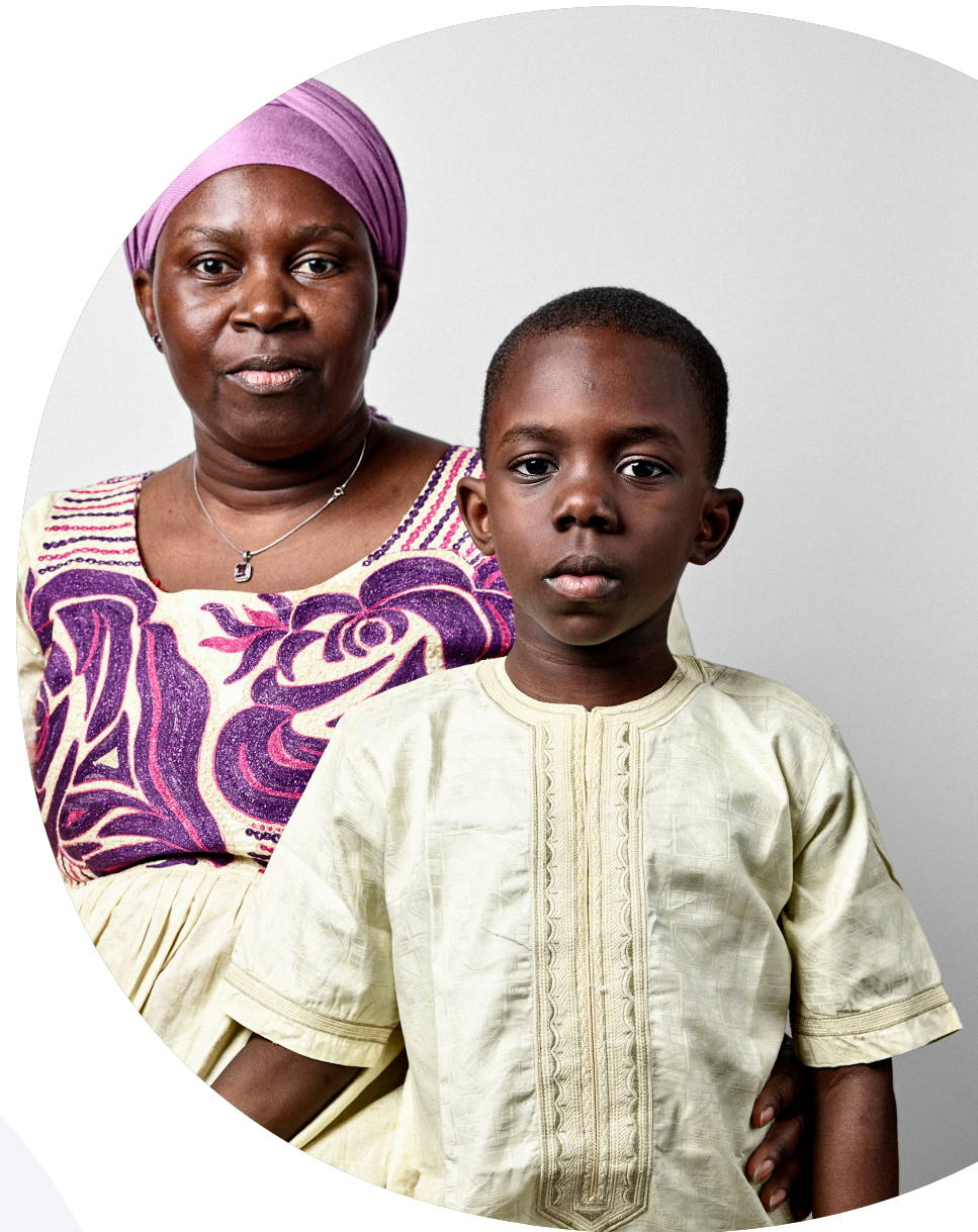
A young boy fighting cancer standing with his mother in Senegal.

Invest in the training and capacity-building of doctors and nurses and empower local healthcare professionals to deliver high-quality pediatric cancer care and treatment.