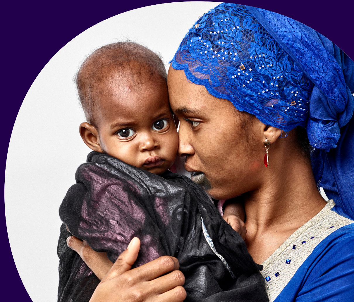
A young child fighting cancer being held by his mother in Senegal.

Our ambition: Support the World Health Organization (WHO) goal of achieving a survival rate of 60% for all children with cancer by 2030 by ensuring access to care, supporting families and training healthcare professionals.